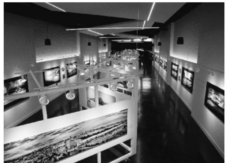
A LOOK INSIDE THE KANDY GALLERY.

You can see a video of the Gallery on the Jewish Standard website at www.thejewishstandardmag.com . https://www.youtube.com/watch?v=Olf4cha547U