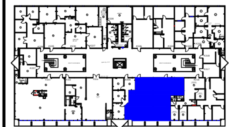
SPENCER STREET KEY PLAN