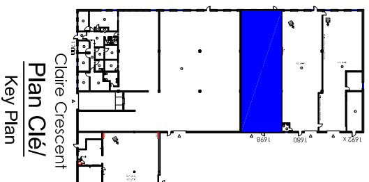
Claire Crescent Plan Clé/ Key Plan