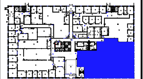
TRI-COUNTY PARKWAY KEY PLAN