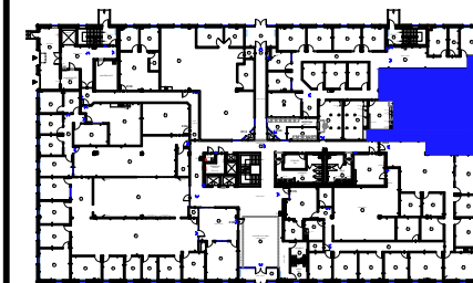
TRI-COUNTY PARKWAY KEY PLAN